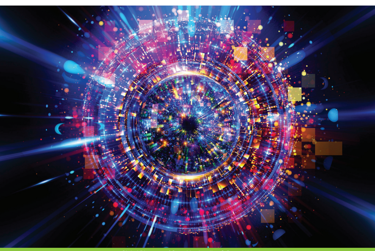
Global Directory of Securities Lending & Repo 2020